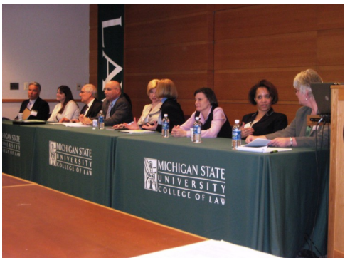
Above: "Town Hall" Meeting; Right: MichAll Members Discuss Important Skills