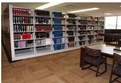
New bookshelves and tables at Auburn Hills campus